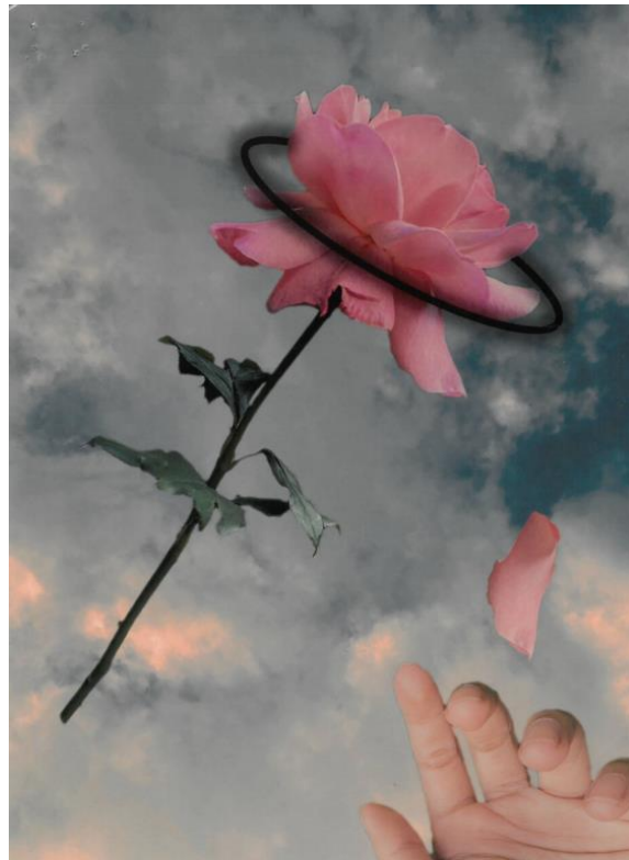
'The Falling Rose'